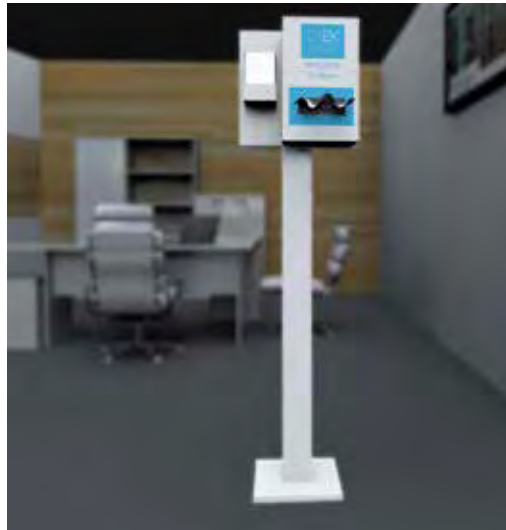
Hygiene station with sanitiser dispenser