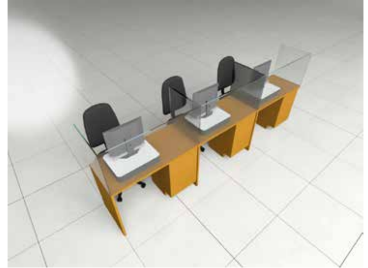
Multiple desk solutions