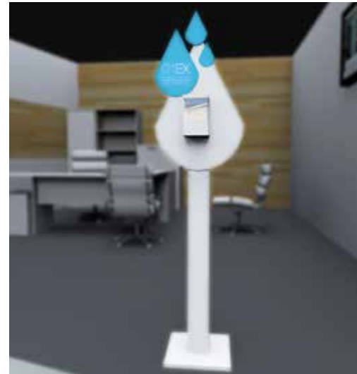
Sanitiser unit with custom shaped back board