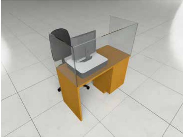
Single Desk Surrounds

Ensure the safety of your staff with fully fitted screens to their work space. Whether just a single desk, or a cluster of multiple work stations, we can help you protect your staff from spreading germs.