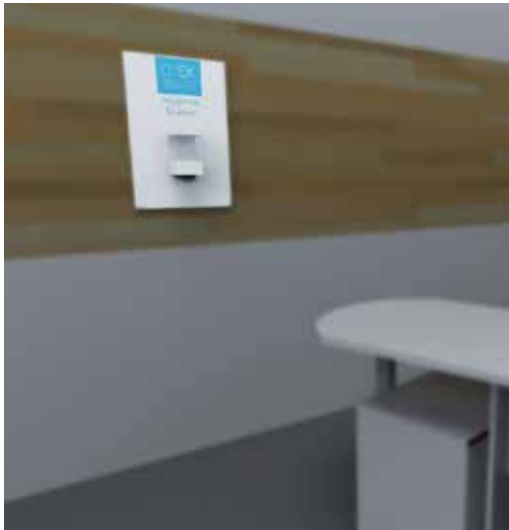
Wall mounted dispenser