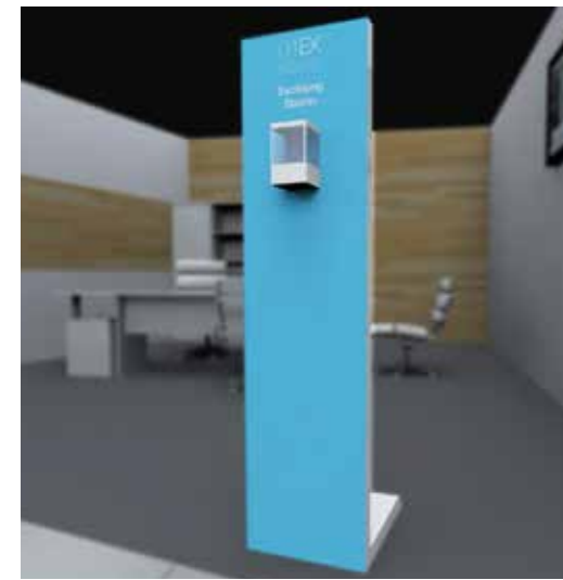
Freestanding unit with or without lockable cupboard with full graphic included